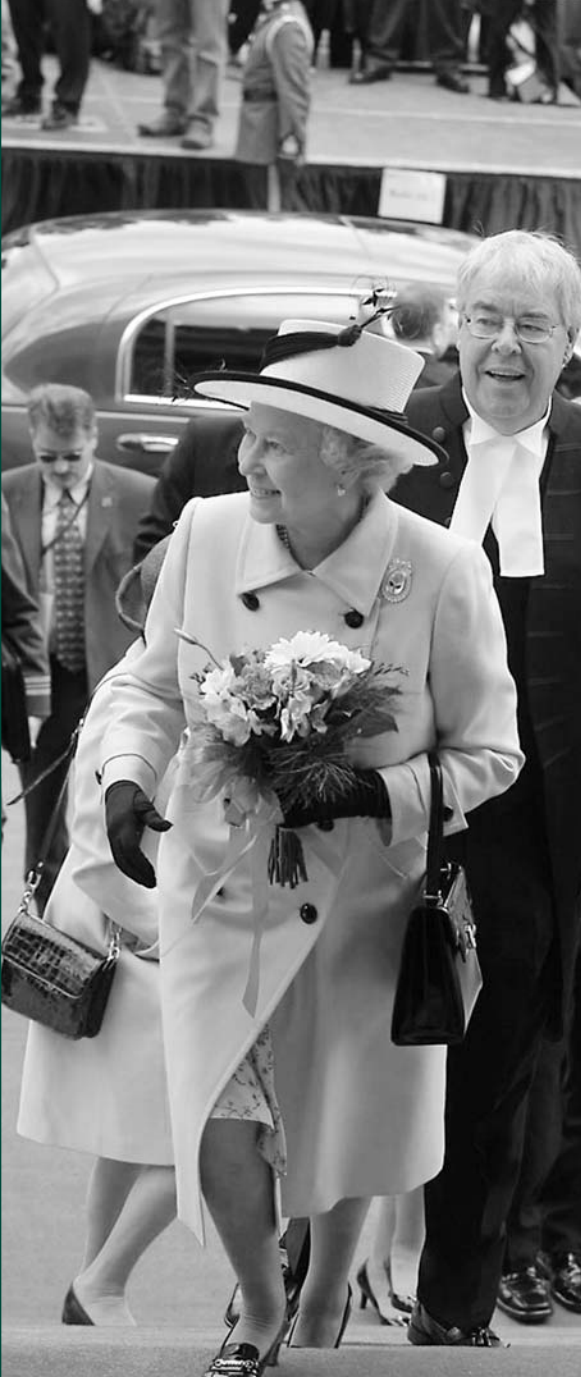
Photo above: Her Majesty Queen Elizabeth II during her visit to the Alberta Legislature during Alberta's centennial year.