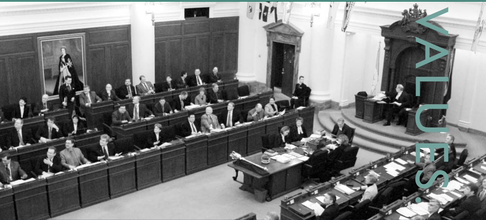
Photo above: the 26th Legislative Assembly of Alberta during session.