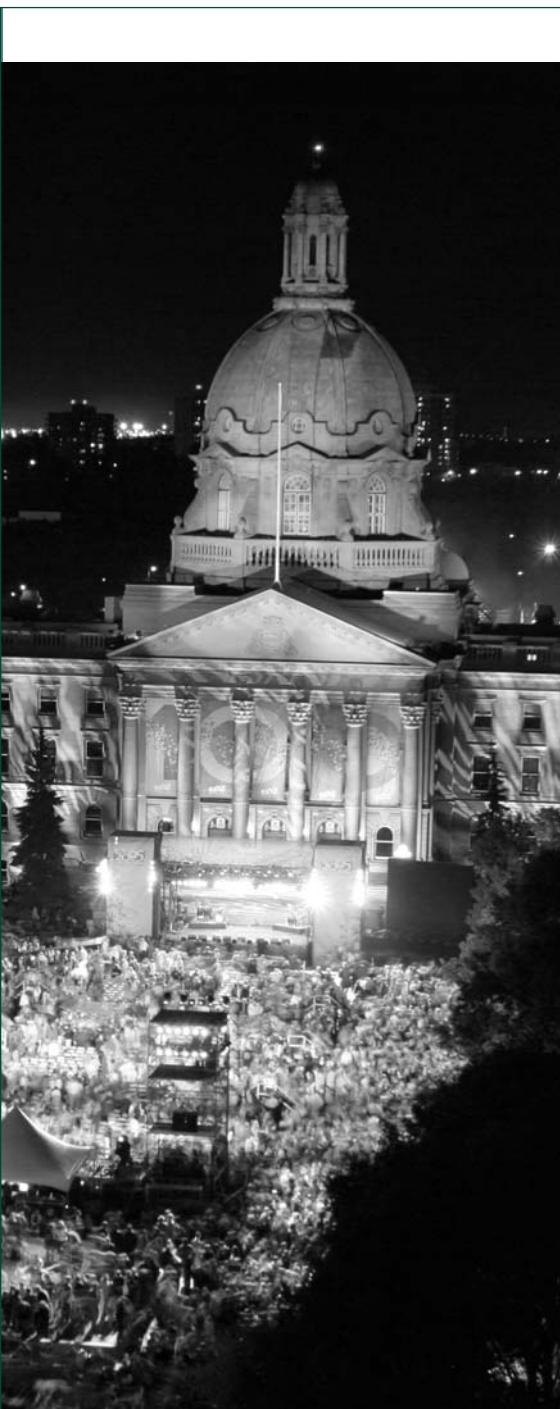
Photo above: thousands gathered at the Legislature during Alberta's centennial celebrations on September 1.