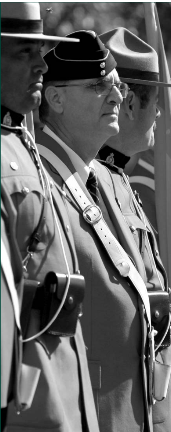
Photo above: Alberta's centennial festivities at the Legislature Grounds.