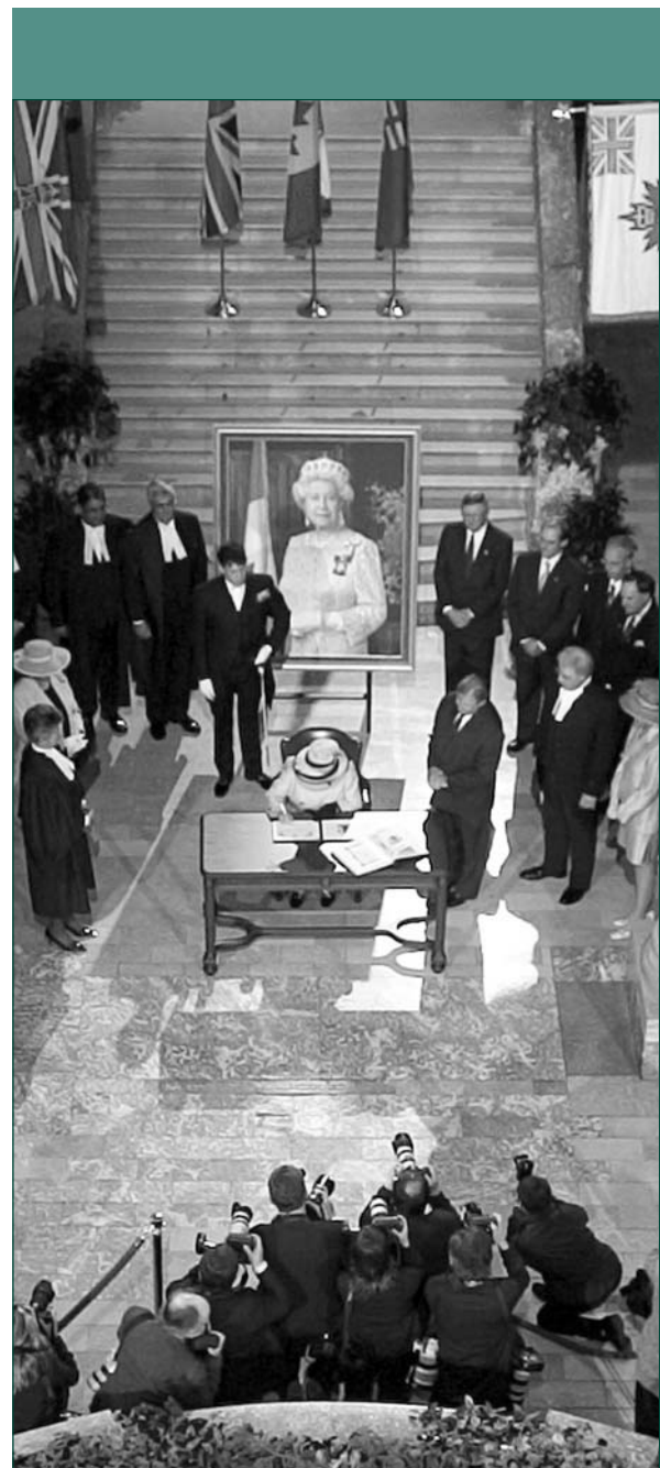
Photo above: Her Majesty Queen Elizabeth II signs the Distinguished Visitors Books of the Lieutenant Governor and the Speaker in front of the Grand Staircase in the Legislature Rotunda.

A number of youth parliament organizations visit the Legislature, and some used the Chamber for mock parliaments. The Alberta Girls Parliament (March 31); the Forum for Young Albertans (April 24-30 and May 2-8); University of Alberta Model Parliament (January 28-30); the Parlement jeunesse de l’Alberta (November 11-13); Alberta Debate and Speech Association (November 18-19); and the TUXIS Parliamentary Alumni Society of Alberta (December 26-31).