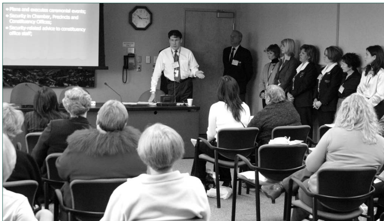
Photo above: the Sergeant-at-Arms/Director of Visitor, Ceremonial and Security Services presenting at the Winter Constituency Outreach Seminar.