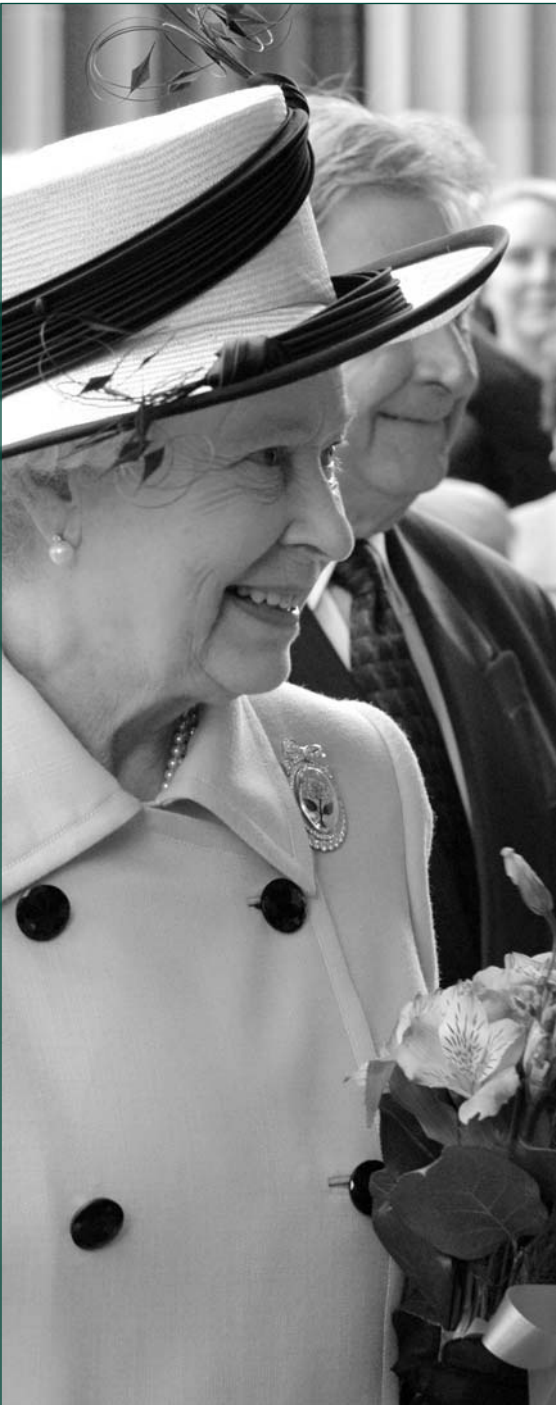
Photo above: in celebration of Alberta's centennial, Her Majesty Queen Elizabeth II visited Alberta's Legislature.