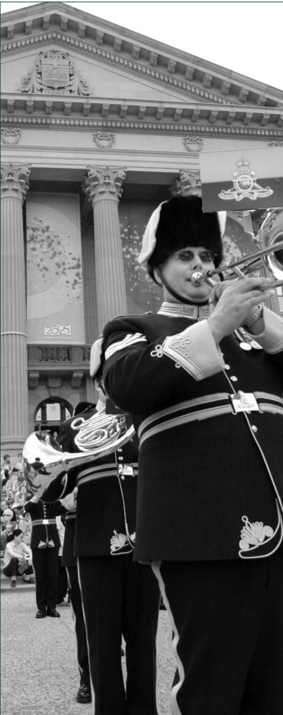
Photo above: every year thousands gather at the Legislature to celebrate Canada Day.