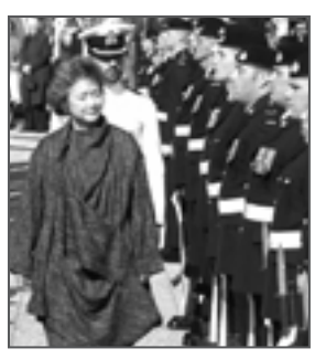
Governor General, the Rt. Hon. Adrienne Clarkson, inspects the honour guard at a ceremony marking the 100th anniversary of the Lord Strathcona's Horse (Royal Canadians). She unveiled a statue of the first Lord Strathcona on the south grounds of the Legislature Building.