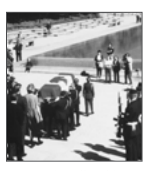
The coffin of former Member and former Lieutenant Governor, the Hon. J.W.Grant MacEwan is escorted from the Legislature Building following an official Lying-in-State.