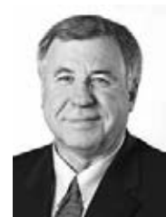
ROBIN CAMPBELL PC West Yellowhead Deputy Government Whip (to 01/15/10) Government Whip (from 01/15/10)