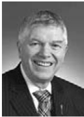
HON. MEL KNIGHT PC Grande Prairie-Smoky Minister of Energy (to 01/15/10) Minister of Sustainable Resource Development (from 01/15/10)