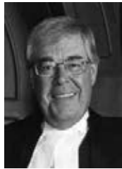
HON. KEN KOWALSKI PC Barrhead-Morinville- Westlock Speaker