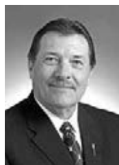
HON. JACK HAYDEN PC Drumheller-Stettler Minister of Infrastructure (to 01/15/10) Minister of Agriculture and Rural Development (from 01/15/10)