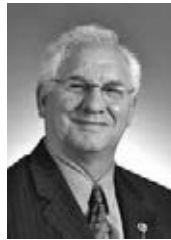
FRED LINDSAY PC Stony Plain Solicitor General and Minister of Public Security (to 01/15/10)