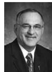
HON. HECTOR G. GOUDREAU PC Dunvegan-Central Peace Minister of Employment and Immigration (to 01/15/10) Minister of Municipal Affairs (from 01/15/10) Deputy Government House Leader (to 01/15/10)