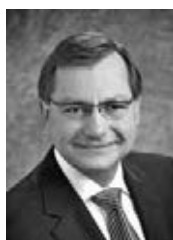
HON. ED STELMACH Fort Saskatchewan- Vegreville Premier President of Executive Council