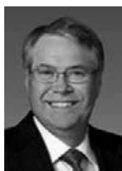
HON. ROB RENNER Medicine Hat Minister of Environment Deputy Government House Leader