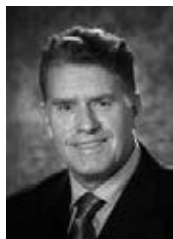
HARRY B. CHASE AL Calgary-Varsity Official Opposition Whip