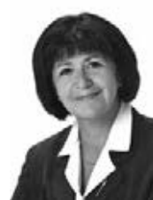
HON. YVONNE FRITZ WA Calgary-Cross Minister of Housing and Urban Affairs (to 01/15/10) Minister of Children and Youth Services (from 01/15/10)