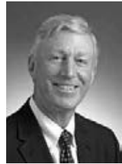
HON. TED MORTON PC Foothills-Rocky View Minister of Sustainable Resource Development (to 01/15/10) Minister of Finance and Enterprise (from 01/15/10)