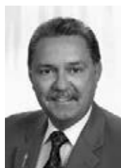
HON. GENE ZWOZDESKY Edmonton-Mill Creek Minister of Aboriginal Relations (to 01/15/10) Minister of Health and Wellness (from 01/15/10) Deputy Government House Leader