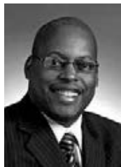
HON. LINDSAY BLACKETT PC Calgary-North West Minister of Culture and Community Spirit