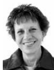
HEATHER FORSYTH PC Calgary-Fish Creek WA Opposition Whip (from 01/25/10) PC (to 01/04/10)