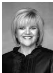
HON. IRIS EVANS PC Sherwood Park Minister of Finance and Enterprise (to 01/15/10) Minister of International and Intergovernmental Relations (from 01/15/10)