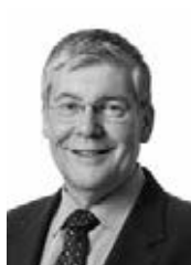
HON. DAVE HANCOCK, QC PC Edmonton-Whitemud Minister of Education Government House Leader