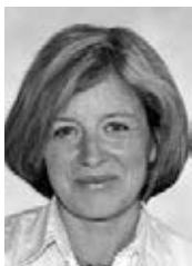
RACHEL NOTLEY ND Edmonton-Strathcona ND Opposition House Leader