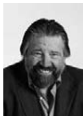
HON. RAY DANYLUK PC Lac La Biche-St. Paul Minister of Municipal Affairs (to 01/15/10) Minister of Infrastructure (from 01/15/10)