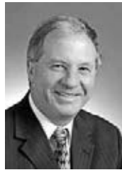
HON. RON LIEPERT PC Calgary-West Minister of Health and Wellness (to 01/15/10) Minister of Energy (from 01/15/10)