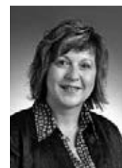
HON. HEATHER KLUMCHUK PC Edmonton-Glenora Minister of Service Alberta