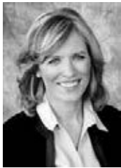
HON. CINDY ADY PC Calgary-Shaw Minister of Tourism, Parks and Recreation