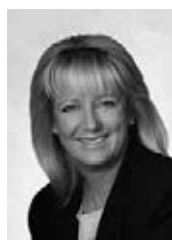
JANIS TARCHUK Banff-Cochrane Minister of Children and Youth Services (to 01/15/10)