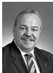
HON. LUKE OUELLETTE PC Innisfail-Sylvan Lake Minister of Transportation