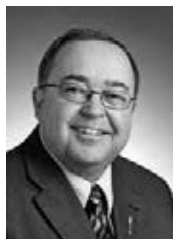
HON. FRANK OERLE PC Peace River Government Whip (to 01/15/10) Solicitor General and Minister of Public Security (from 01/15/10)