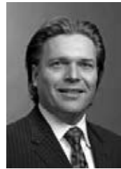
HON. THOMAS A. LUKASZUK PC Edmonton-Castle Downs Parliamentary Assistant, Municipal Affairs (to 01/15/10) Minister of Employment and Immigration (from 01/15/10) Deputy Government House Leader (from 05/10/10)