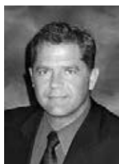
HON. LEN WEBBER Calgary-Foothills Minister of International and Intergovernmental Relations (to 01/15/10) Minister of Aboriginal Relations (from 01/15/10)