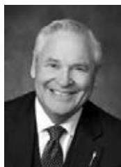
GEORGE GROENEVELD PC Highwood Minister of Agriculture and Rural Development (to 01/15/10)