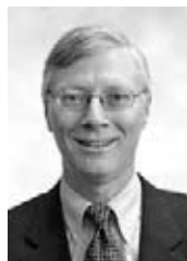
VERLYN OLSON, QC PC Wetaskiwin-Camrose