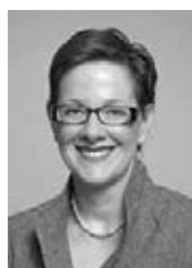
HON. ALISON REDFORD, QC Calgary-Elbow Minister of Justice and Attorney General Deputy Government House Leader